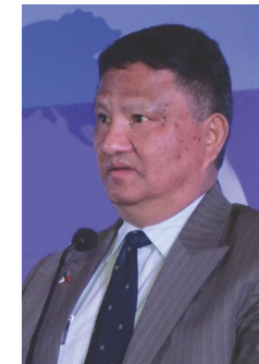
▲ Former Chief Election Commissioner HS Brahma addressing Global Conclave at Hyderabad