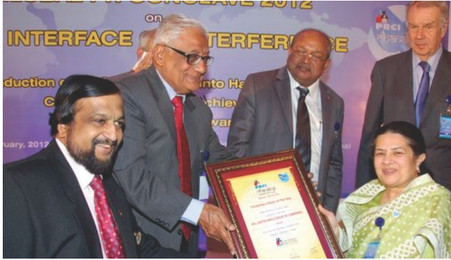
▲ Mrs. Rajashree Birla , Chairperson, Aditya Birla Centre for Community Initiatives and Rural Development, receiving the Corporate Citizen of the Year award for 2011-12.