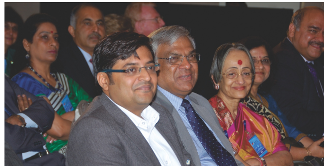
▲ Arnab Goswami in rapt attention at our Mumbai Conclave