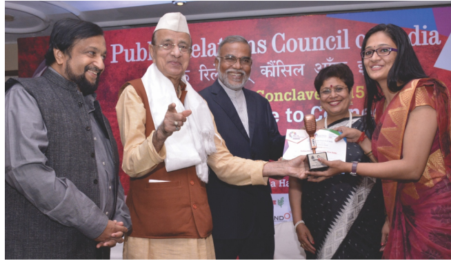
▲ Former Governor of several States Bhishma Narain Singh at Awards Ceremony, New Delhi