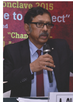
▲ Prasar Bharati Chairman addressing the 9th Global Communication Conclave at New Delhi